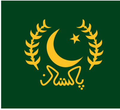
Flag of the President of Pakistan

The President of Pakistan is the head of state of the Islamic Republic of Pakistan . According to the Constitution of Pakistan , the President has "powers, subject to Supreme Court approval or veto, to dissolve the National Assembly , triggering new elections, and thereby dismissing the Prime Minister ". [1] These powers were repeatedly